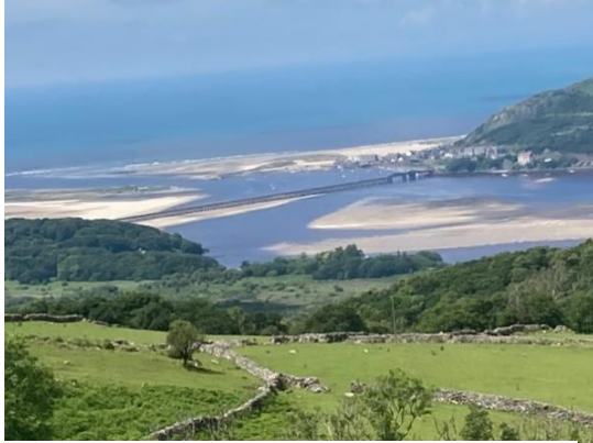
The Mawddach Estuary and Barmouth